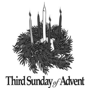
Third Sunday of Advent