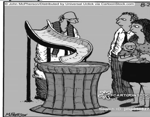
"It makes baptisms a lot more fun for everyone."