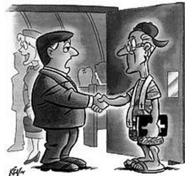
"Pastor, about this new idea to reach teens..."