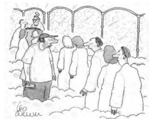
"Pssst!... Two passes... Best prices."